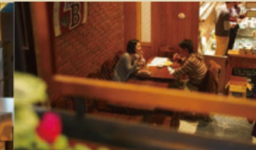
14 Beer House Tir na n-Og Craft Beer House

316-30 Tamachi, Naka-ku M to Th Su 5pm-12am F Sa a day before holiday 5pm-2am 11.30-1.15am Kajimachi, Naka-ku M to Th 5pm-12am F Sa 4pm-2am A day before holiday 5pm-2am Su 4pm-12am