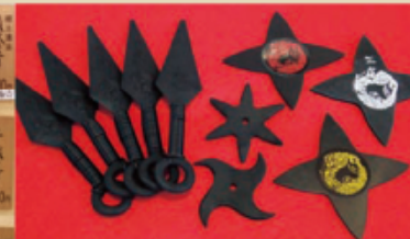
36 Shuriken Dojo Shuriken Throwing Experience

75 Chitose-cho, Naka-ku W to M without the third of M 10am-5pm