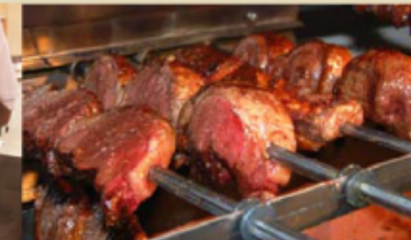
69 Servitu Brazilian Grocery Store

322-7 Hotel Sorissio 2F Sunayama-cho, Naka-ku W to M 11am-2pm 5pm-9pm