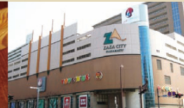
23 Zaza City Shopping Mall

318-25 Sakanamachi, Naka-ku M to Sa 11am-7pm Su Holiday 11am-6pm Closed: W