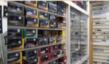
38 Aal Crafts & Models Hobby

Miniature cars, railroad models, plastic models both rare and classic. One of Japan's gems with top shelf stock from all over the world are waiting for you!