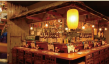
16 Showa Shokudo Izakaya

Maruman Bldg., B-1 Lebel, 329-8 Tamachi, Naka-ku M W to F 6pm-11.30pm(LO) Sa Su Holiday 3pm-11.30pm(LO) Closed: Every Third M