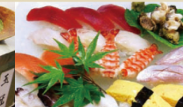
76 Suehiro-sushi Sushi Restaurant

357-22 Sunayama-cho, Naka-ku M to Sa 9am-7pm Closed: Su