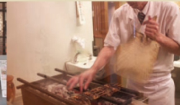
60 Fujita Eel Restaurant

111-2 Hamamatsu Act Tower 5F Itayamachi, Naka-ku 11am-3pm 5pm-11pm Su, Holiday 11am-10pm Closed Dec 31st to Jan 1st