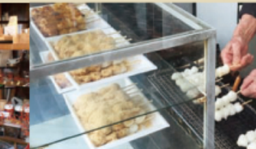
87 Midoriya Japanese Desert

107-15 Matsushiro-cho, Naka-ku M to Sa 1pm-8pm (Jun-Sep) 12am-7pm (Oct-May)