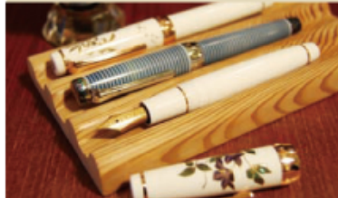
21 BUNGU BOX Fountain Pen Store

318-25 Sakanamachi, Naka-ku M to Sa 9am-7pm Holiday 10am-6pm Closed: Su