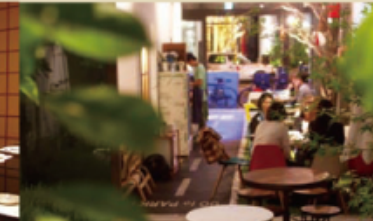
5 PARK/ING Public Café Bar

314-25 2F Sakanamachi, Naka-ku Tu to Su 5pm-12am