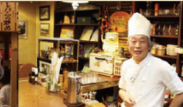
18 Orange Papa Pasta

330-1-1F Tamachi, Naka-ku 318-17 Sakanamachi 325-4 1F Sunayama-cho 357-29 Sunayama-cho 5pm-12am