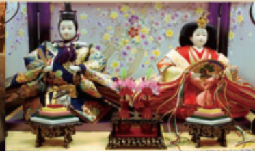
3 Jugetsu Sumitaya Japanese Dolls shop

The doll making tradition is alive and strong in Japan. Boys and Girls days are celebrated on the calendar each year and these artisan princess and samurai displays are masterpieces.