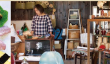
83 1334+ Zakka

360-6 Sunayama-cho, Naka-ku Th to Tu without the second of Tu 11.30am-1.30pm 5pm-10pm