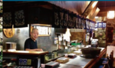
12 Tenkin Tempura Restaurant

325-10 Tamachi, Naka-ku Th to Tu 10am-6.30pm