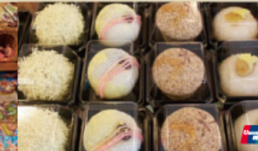
30 Ganyudo Japanese Dessert

Zaza city west side 2F 15 Kaji-machi, Naka-ku 10am-8pm