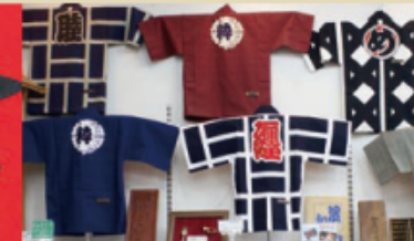
37 Kamoeya Festival supplies shop

76 Chitose-cho, Naka-ku Th to Tu 11am-9pm