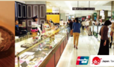
50 Entetsu Department Store

102-12 2F Itayamachi, Naka-ku Tu to Sa 11.30am-2pm 6pm-10pm Su 11.30am-2pm