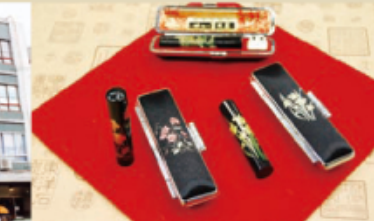
10 Kaneido Japanese Stamp Seal

A stamp seal - seal specialty shop of 130 years foundation. How about a seal of your own name sealed by professional craftsmen!