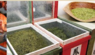
75 Marulenchaho Japanese Green Tea

A Japanese tea specialty store founded in 1920. Most of them are original blends of shop confidence. You can purchase fresh tea packed on the spot sold in bulk as it is now rare.