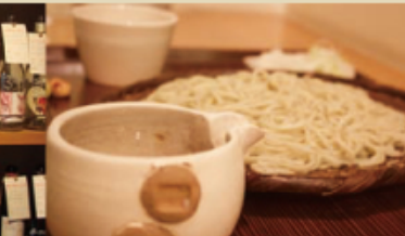
42 Naru Soba Soba Restaurant

102-17 Itayamachi, Naka-ku Tu W Th Su 6pm-11pm F Sa A day before holiday 6pm-12am