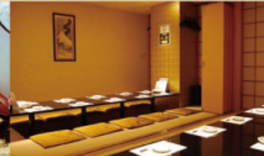
4 Koshitsu Enkai 12 Kagetsu Izakaya

They have private rooms that can be used from 2 people each room. Horigotatsu seats are easy to sit and relaxing without worrying about the surroundings. There are plenty of fresh fish and vegetable dishes and kinds of sake matching it.