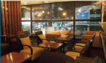
2 Passeretti Café & Dining

A great place for a catch up with friends day or night, a western inspired menu with coffee and drinks. With regular exhibitions and live events, sink into one of the sofa seats and relax.