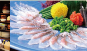
19 Totoichi Japanese Restaurant

331-5 Tamachi, Naka-ku 11.30am-8pm Closed: W (Open for public holidays)