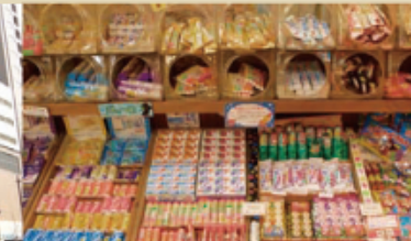
24 Haikara Yokochō Candy Store

Bring back your school days when you were a kid in a candy store with a hand full of pocket money. Only this time you have every Japanese candy there ever was to choose from.