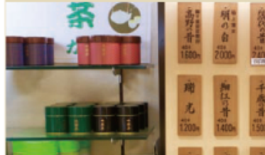
35 Ryumondo Matcha

99-1 Chitose-cho, Naka-ku Tu to Th Su Holiday 11.30am-2pm 5.30pm-12am F Sa A day before holiday 11.30am-2pm 5.30pm-1am