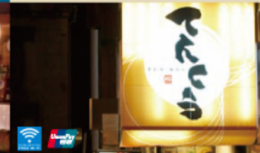
13 2 Tenkuu Izakaya

325-29 Tamachi, Naka-ku Th to Tu 11am-1pm 5pm-7pm