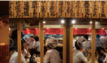
17 22 71 74 Tanto Izakaya

317-9, 1F Sakanamachi, Naka-ku M to Th Su Holiday 5pm-3am F Sa A day before holiday 5pm-5am