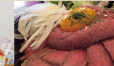
34 AB-Z American Bar

102 Chitose-cho, Naka-ku Th to Tu 10am-7pm