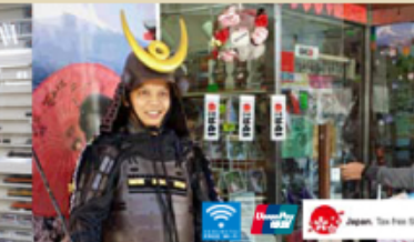
40 Kawai clothing store Souvenir Shop

1-47 Kajimachi, Naka-ku W to M 1pm-7pm Su Holiday 12pm-7pm