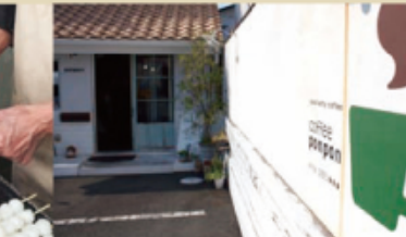
88 Coffee Ponpon Coffee Beans Shop

84 Motohama-cho, Naka-ku Tu to Sa 10am-8pm Su 10am-7pm