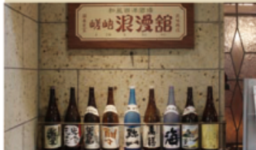
59 Sago Romankan Izakaya

320-2 Sunayama-cho, Naka-ku 10am-7.30pm restaurants 10.30am-9pm