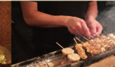
32 Ohgiya Morugai Yakitori

Chicken! in all its glory -and parts served grilled for goodness. With stools set up around the kitchen its interior pays tribute to Japans casual dining style past.