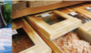
20 Itoshouten Dashi

It is a specialty store of soup and dry matter. The original non-additive pack, You can easily take the delicious "dashi" which is perfect for souvenirs!