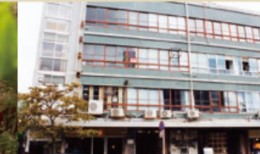
8 Kagiya Building

315-24 Tamachi, Naka-ku M W Th Su 10.30am-12am F Sa 10.30am-3am