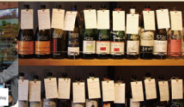
41 La - Cachette Wine Bistro

1-63 Kajimachi, Naka-ku M to F 11am-7pm Sa 10.30am - 7.30pm Su 10.30am - 7pm Closed: W